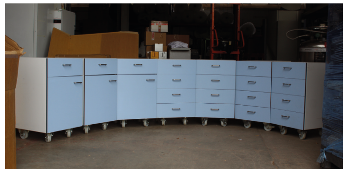
This set of 7 lab cupboards have been sold to a small biomedical research company who needed to build a 'mobile sequencing lab' whilst their building was being refurbished.