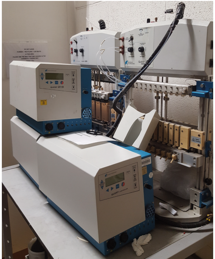
Surplus equipment in the Department of Chemistry

UniGreenScheme has already visited several key departments and large quantities of surplus equipment has already been identified for collection and resale.