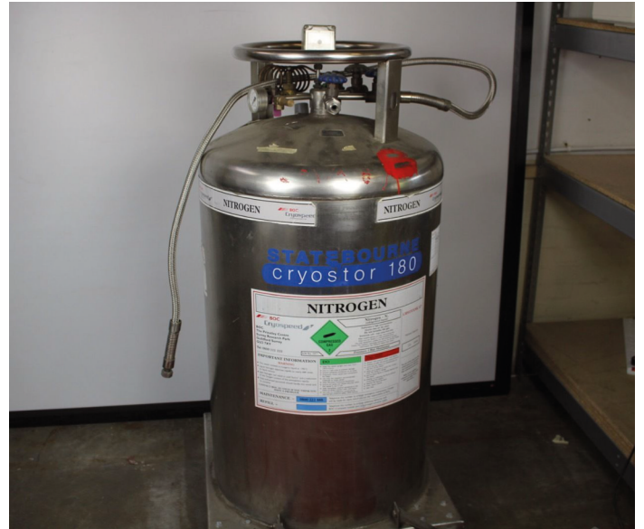
This Statebourne Cryostore now being redeployed at the University of Bath

Rather than all this equipment being stored indefinitely (and likely going to disposal) it is now seeing second lives in other deployments.