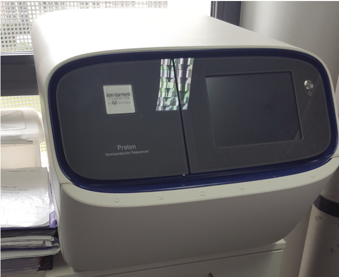
Surplus equipment in the Department of Life Sciences