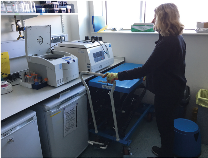
UniGreenScheme are experienced with specialist equipment removal and bring all the appropriate equipment to the site

“UniGreenScheme offer the perfect solution to the problem of surplus equipment. With barely the lift of a finger, universities can free up space, re-purpose the equipment to a good home, and receive some money back at the end of it all. UGS are personable, professional and efficient, and I’d highly recommend them.”