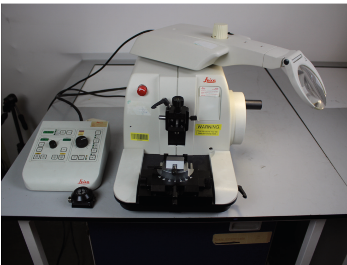
This Leica Microtome is now listed for resale by UniGreenScheme